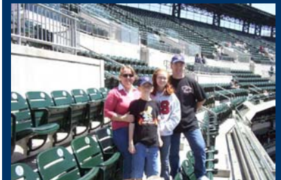
At Comerica Park, home of the Detroit Tigers. Summer 2003