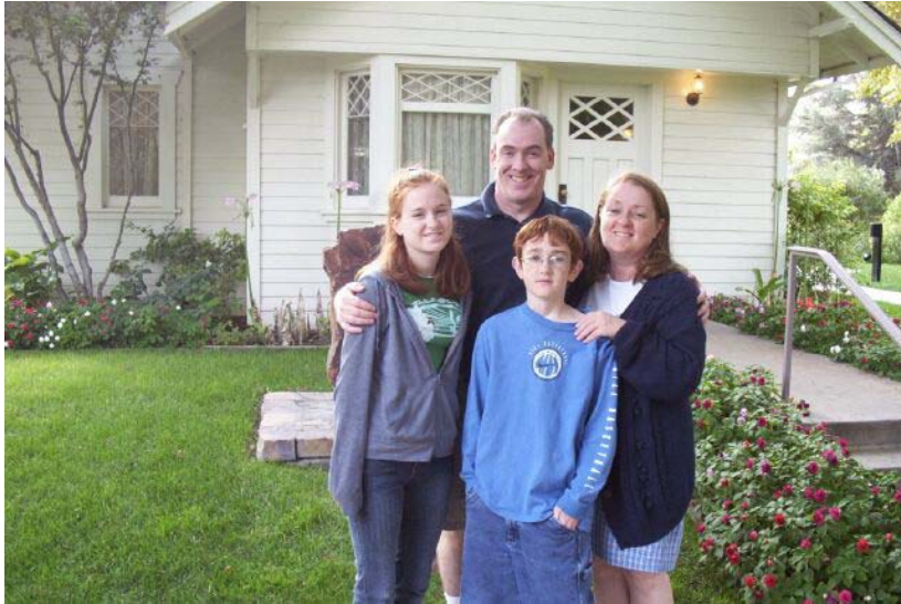
Outside the Richard M. Nixon birthplace home. Yorba Linda, CA. October 2004